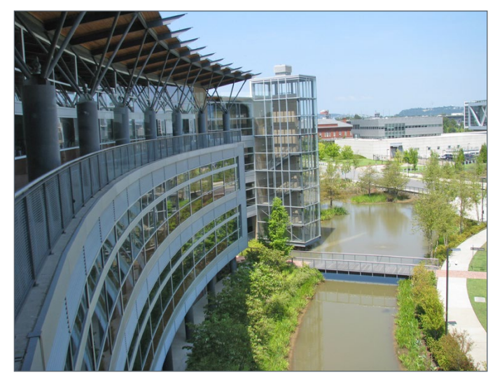
Heifer International Headquarters, Little Rock, Arkansas.

The NAIOP Research Foundation commissioned this research brief to offer insights into the key considerations that guide sustainable brownfield redevelopment. In 2009, with support from the U.S. Environmental Protection Agency (EPA), the author of this brief initiated a research project to study more than two dozen brownfield redevelopment projects across the U.S. Ten of these were already considered sustainability trailblazers and Best Management Practices (BMP) in the brownfields arena, and 14 others were granted seed funding by the EPA to incorporate sustainability as part of a Sustainable Brownfields Pilot program. He followed the progression of these projects for more than a decade and published the findings in Sustainable Brownfield Development: Building a Sustainable Future on Sites of our Polluting Past, on which this research brief is based. Lessons learned from these projects offer developers guidance on how they can