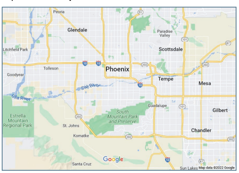
Map 3: Phoenix-area jurisdictions

The Index can be a powerful tool for comparing submarket opportunities. For example, if a developer were attracted to the strong fundamentals for industrial development in the Phoenix metropolitan area, they could undertake the same exercise to compare local jurisdictions. Indeed, Index data for the Phoenix-area submarkets reveal a range of results. Map 3 shows the relative locations and major highway access for the Phoenix-area jurisdictions included in the Index, and Table 4 shows how jurisdictions scored according to the Index, alongside demographic and basic industrial market data.5