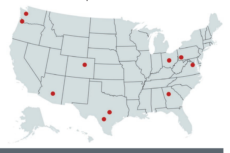
Map 2: Map showing locations of jurisdictions used in industrial market comparison

TABLE 2 Demographic and basic industrial market data for highlighted jurisdictions