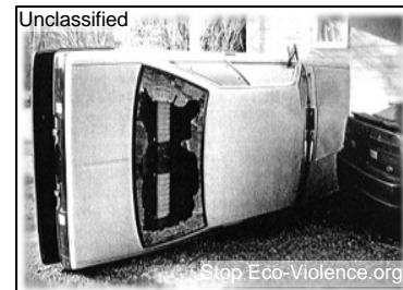
(U) SHAC members resort to violence against HLS employees and their personal property.

(U//FOUO) DHS/I&A Comment: HLS is one of the world’s largest research organizations conducting product testing on animals. HLS is headquartered in the United Kingdom and operates facilities in New Jersey. SHAC favors a more radical approach to resistance than other animal rights activists and its personal harassing tactics have been highly effective in instilling fear in the victims, their families, and their associates. SHAC’s success in targeting individuals may inspire other animal rights extremists to adopt the same tactics. Other extremists could perceive the SHAC-7 verdict as an attack on the animal rights movement and as an incentive to adopt more aggressive and violent forms of action. The animal release incident in Massachusetts may be the first of occurrences committed as an act of solidarity with the SHAC-7.